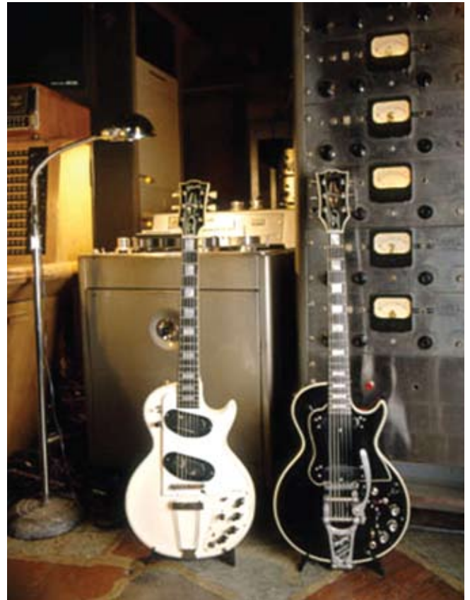
Two of Les Paul's eponymous guitars.

AT: There have been a number of studies that have shown that depression and isolation increases in