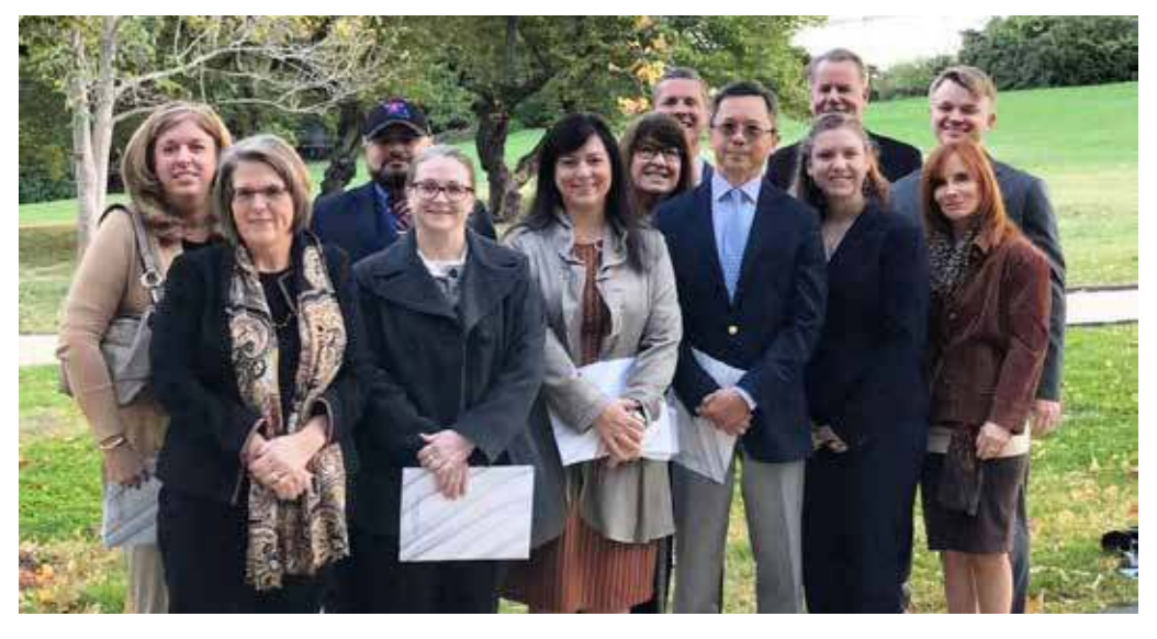
The Academy Board of Directors pose on the U.S. Capitol grounds before a full day of Hill visits.

his Year in Review details how the American Academy of Audiology mobilized its legislative, regulatory, and political resources to advocate for audiologists on critical issues facing the profession. Of note, the Academy came together with the Academy of Doctors of Audiology (ADA) and the American Speech-Language-Hearing Association (ASHA) to draft, secure congressional champions, and lobby additional support for the Medicare Audiology Access and Services Act of 2019 (H.R. 4056, S. 2446). This legislation would grant audiologists "practitioner" status in Medicare, remove the physician referral requirement, and allow audiologists to provide and be reimbursed for diagnostic and treatment services. The Academy also weighed in on multiple legislative proposals on hearing aid coverage, telehealth, and allied health workforce diversity.