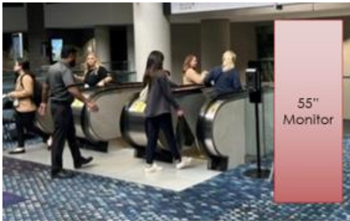
#1: Level 300/right of down escalator to Expo Hall