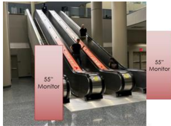
#3 & #4: Expo Hall level on left and/or right of escalators to/from Level 300