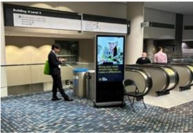
#2: Level 300 left of up escalator from Expo Hall